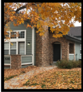
End unit with guest